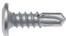
10g x 16mm screws

This way of doing things makes sure that the panels fit together securely and stay in place, so they can be put up quickly and will last a long time.